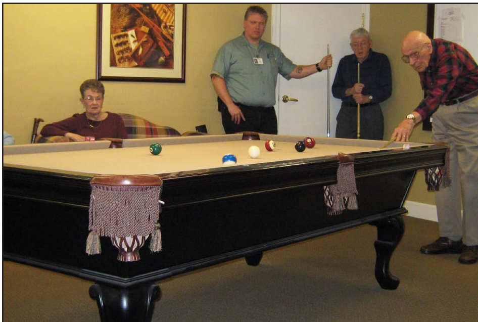
The Waterford community gathered for the Championship Resident and Employee Pool Tournament.