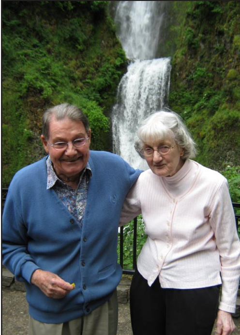
Residents upped the tally for a popular Oregon attraction: Multnomah Falls in the Columbia River Gorge National Scenic Area. They also spent a leisurely lunch at the Multnomah Falls Lodge.