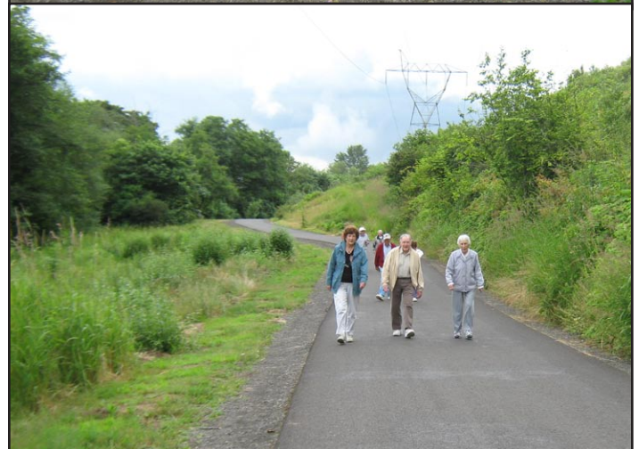
The Stepping Out walking group enjoyed part of the eight-mile Burnt Bridge Creek Trail.