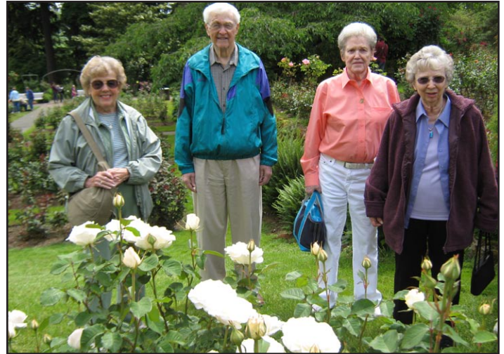
Surrounded by thousands of roses, residents toured Portland's Rose Gardens, which is made up of the International Rose Test Garden, Peninsula Park, and Ladd's Addition.